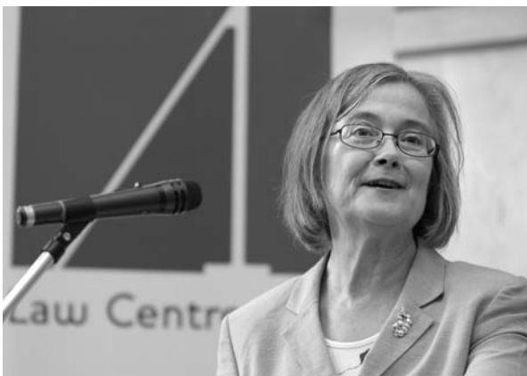
Lady Hale speaking in June at an event organised by Law Centre (NI)

Lady Hale, the first woman Law Lord, gave a keynote lecture entitled 'Making a difference - why we need a more diverse judiciary' at an event organised jointly by Law Centre(Northern Ireland) and Queen's University's Servicing the Legal System.