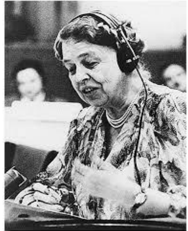
Anna Eleanor Roosevelt

Unless these rights have meaning there, they have little meaning anywhere. Without concerted citizen action to uphold them close to home, we shall look in vain for progress in the larger world.”